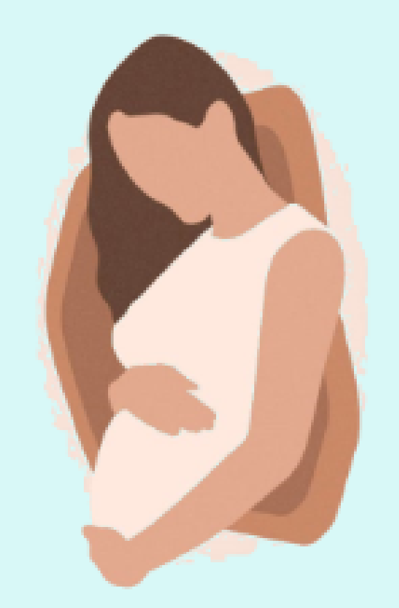
Hormonal Changes & Pregnancy