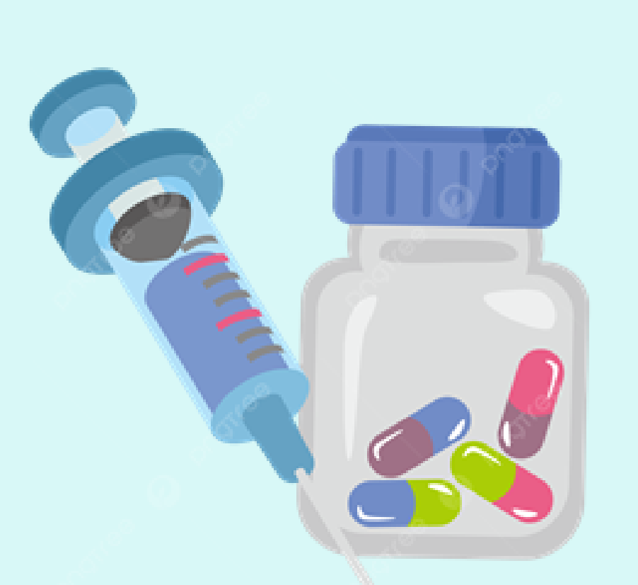
Sudden changes in medication or steroids