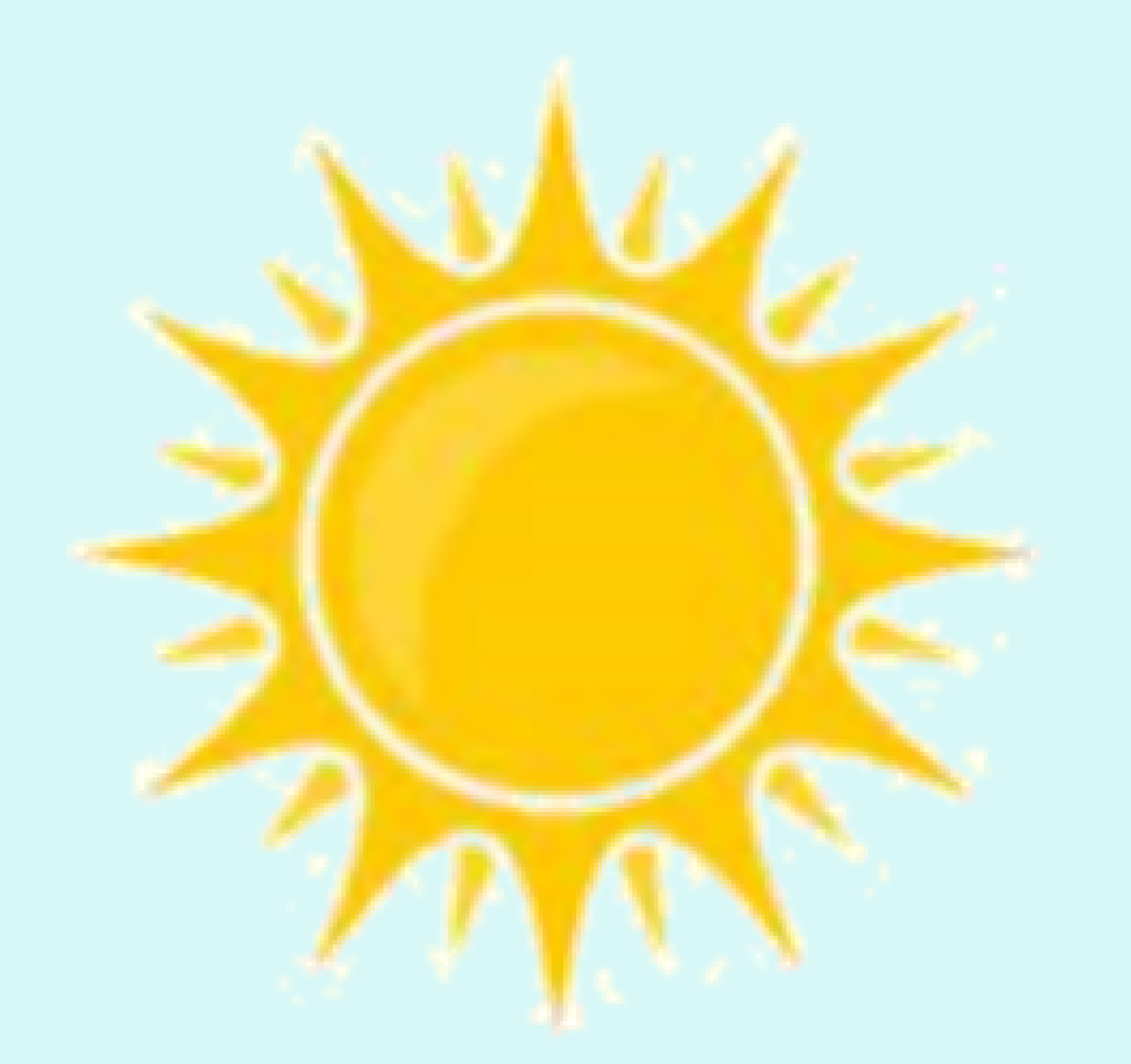
Overexposure to Sun